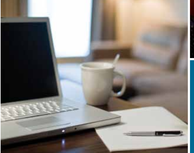
You're not just a guest. You're a welcome resident .