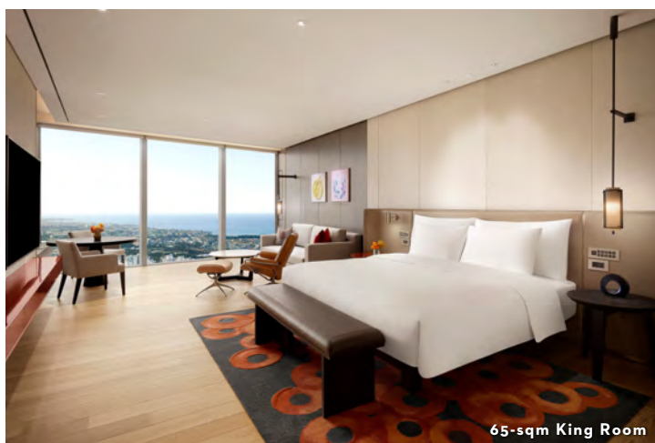
65-sqm King Room

The modern Korean lifestyle comes to bloom at Grand Hyatt Jeju. Experience the multi-dimensional culture of Korea, taking the world by storm in food, wellness, fashion and entertainment, under one roof. As part of Jeju Dream Tower, the hotel is primed to be Asia's leading integrated lifestyle destination with a grand showcase of 1,600 rooms and suites, 14 trend-setting restaurants and bars, two spas, eight-residential-styled meeting spaces, the island's largest outdoor deck with an infinity pool and HAN Collection fashion retail.