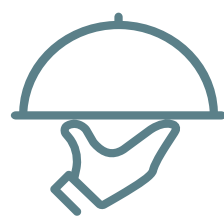
Food and Beverage Delivery