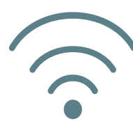
Free Internet Access