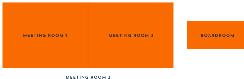
MEETING ROOM 3